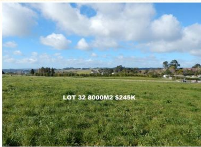
LOT 32 8000M2 $245K